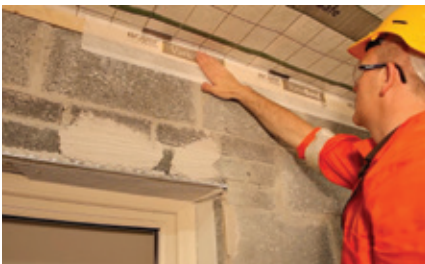
Timber wall plate to block junction