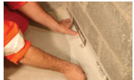
Floor to wall junctions