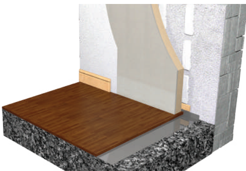
Solid walls: internal dry lining MLK fixed to plaster dabs