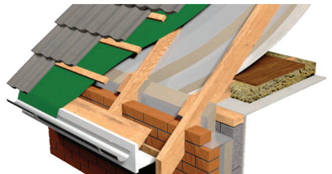
Pitched roof: MLK below rafters