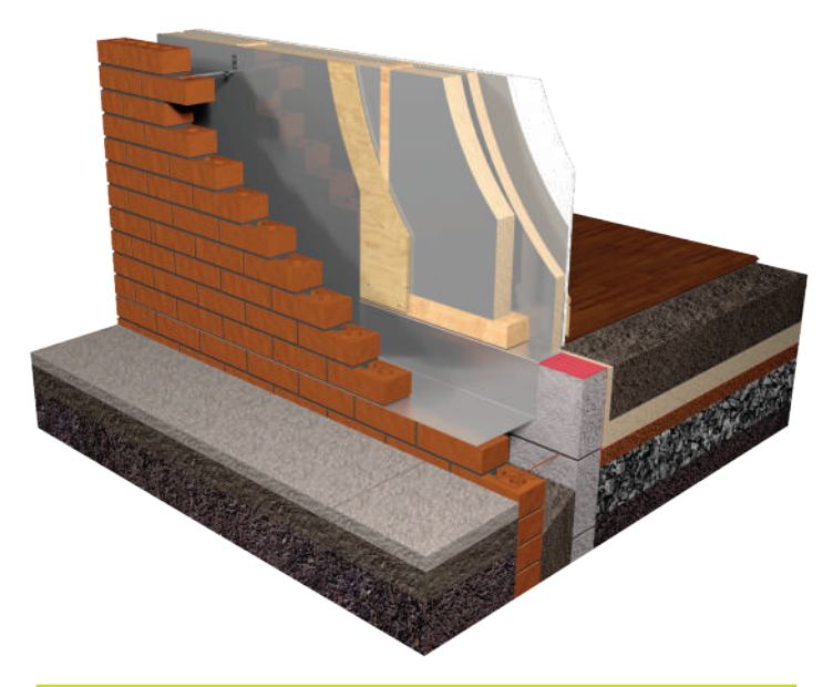
Cavity walls: Mannok Therm Wall / MW in timber frame*