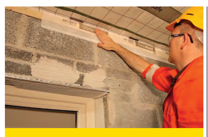
Timber wall plate to block junction