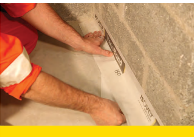
Floor to wall junctions