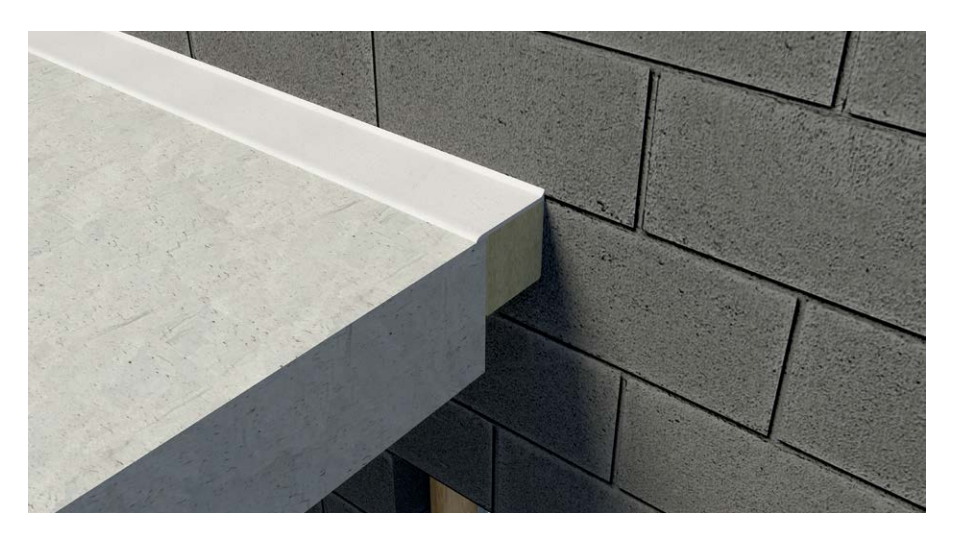
Linear joint seals